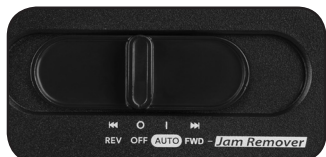
▲ Power switch in auto position

Use thick paper stock or greeting card ► to push the jam through