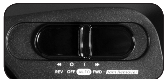
▲ Power switch in auto position

Use thick paper stock or greeting card ► to push the jam through